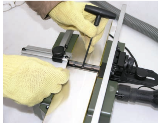
Changing blades could not be easier

A Proxxon product is always going to cost you more and there are probably cheaper planers around. What you are paying for is good design, and quality engineering and build. Most full sized machines are heavy, take up room in the workshop and are not easily moved, so if you only undertake small scale work it is useful to have something more tailored to your requirements. This machine is solid, well built and accurate and at 5.2 kilos it is light enough to pick up and put away. This latest addition to the Proxxon range of precision machines is ideal to use with the Proxxon FET saw and the thicknesser which you may be lucky enough to already have. With this combination you should be able to produce a wide range of accurately dimensioned soft and hardwood for small woodworking and woodturning projects.