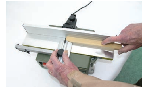
Micro adjustment on fence

"A nicely planed piece of timber is a joy to behold and to run your fingers over, but beware – the edges can be sharp!"