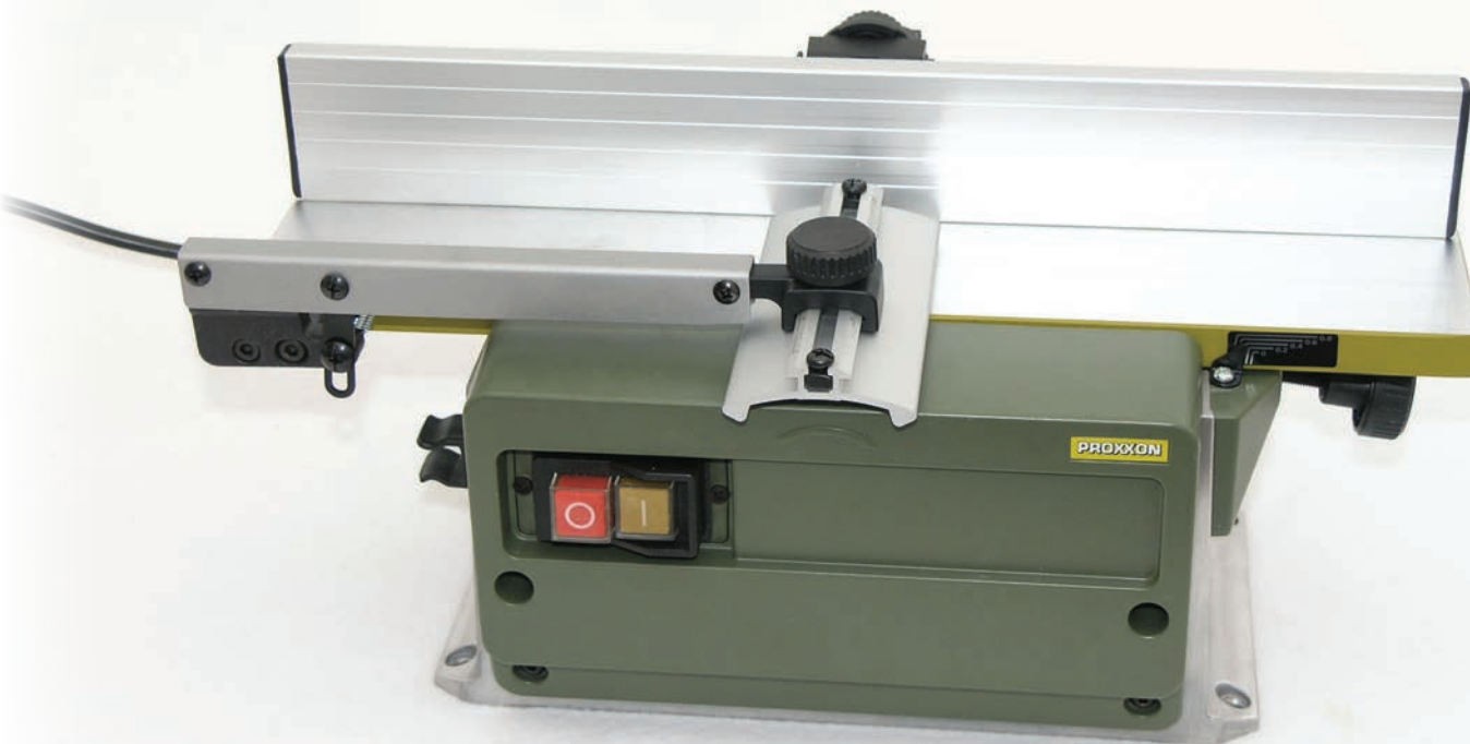
Front of AH80 Planer showing NVR switch

"This machine is solid, well built and accurate and at 5.2 kilos it is light enough to pick up and put away."