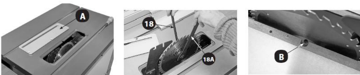
Figures A, B and C

Raise the saw blade to its highest point. Remove the saw blade guard. Remove the 5 screws that secure the table insert, place carefully aside and remove the table insert. (A) Using a spanner and the tommy bar provided, put the spanner onto the flats on the nut. Turn the saw until the tommy bar hole (B) is visible. Insert the tommy bar (18) and turn the saw to allow it to rest against the front edge of the saw slot. The tommy bar hole is in the inside platewasher component. See figures A, B and C.